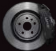
4-PISTON - FRONT GREY CALIPERS