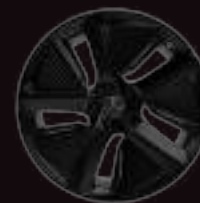
21" 5-SPOKE AERO* GLOSS BLACK