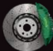
6-PISTON - FRONT GREEN CALIPERS LIGHTWEIGHT BRAKE DISCS