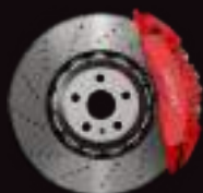
6-PISTON - FRONT RED CALIPERS LIGHTWEIGHT BRAKE DISCS