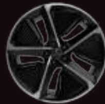
21" 5-SPOKE AERO GREY