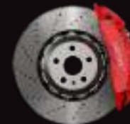
6-PISTON - FRONT RED CALIPERS LIGHTWEIGHT BRAKE DISCS