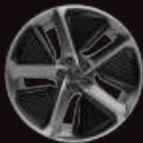
21" 5-SPOKE AERO SILVER