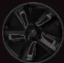
21" 5-SPOKE AERO* GLOSS BLACK