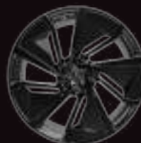
22" 5-SPOKE GLOSS BLACK WITH CARBON FIBRE