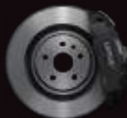
4-PISTON - FRONT GREY CALIPERS