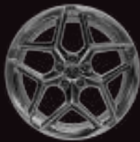
21" 10-SPOKE SILVER