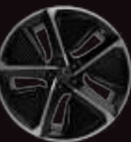
21" 5-SPOKE AERO* GREY