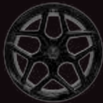
21" 10-SPOKE GLOSS BLACK