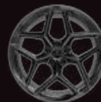
21" 10-SPOKE GREY