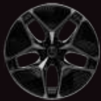
20" 5-SPOKE AERO GREY