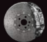
10-PISTON - FRONT SILVER CALIPERS CARBON CERAMIC BRAKE DISCS