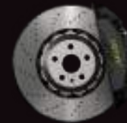
6-PISTON - FRONT BLACK CALIPERS LIGHTWEIGHT BRAKE DISCS