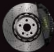
6-PISTON - FRONT BLACK CALIPERS LIGHTWEIGHT BRAKE DISCS