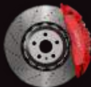
6-PISTON - FRONT RED CALIPERS LIGHTWEIGHT BRAKE DISCS