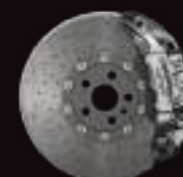
10-PISTON - FRONT SILVER CALIPERS CARBON CERAMIC BRAKE DISCS