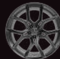
22" 10-SPOKE GLOSS GREY