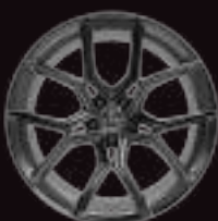
22" 10-SPOKE GLOSS GREY