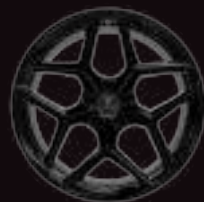
21" 10-SPOKE GLOSS BLACK