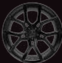
22" 10-SPOKE GLOSS BLACK