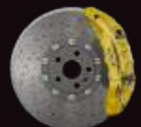
10-PISTON - FRONT YELLOW CALIPERS CARBON CERAMIC BRAKE DISCS