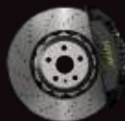
6-PISTON - FRONT BLACK CALIPERS LIGHTWEIGHT BRAKE DISCS