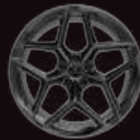
21" 10-SPOKE GREY