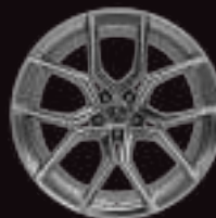
22" 10-SPOKE GLOSS SILVER