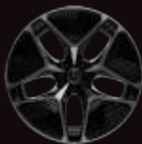
20" 5-SPOKE AERO GREY