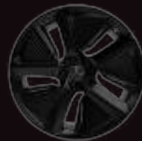
21" 5-SPOKE AERO GLOSS BLACK