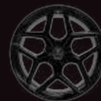
21" 10-SPOKE GLOSS BLACK