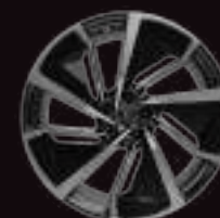
22" 5-SPOKE GLOSS GREY WITH CARBON FIBRE