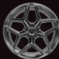
21" 10-SPOKE SILVER