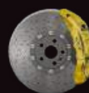
10-PISTON - FRONT YELLOW CALIPERS CARBON CERAMIC BRAKE DISCS